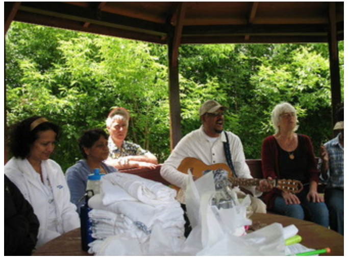
Blue Star Canada Family Day 2009